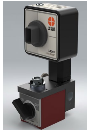
T-1295 Target Mounted in T-242 Straightness & T-243 Flatness Measuring Bases