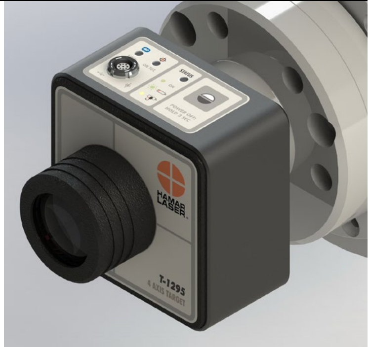
T-1295 Target with 3 in. (75 mm) with Lens Mounted in Spindle